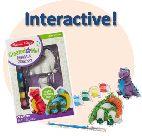
Easy to talk together!